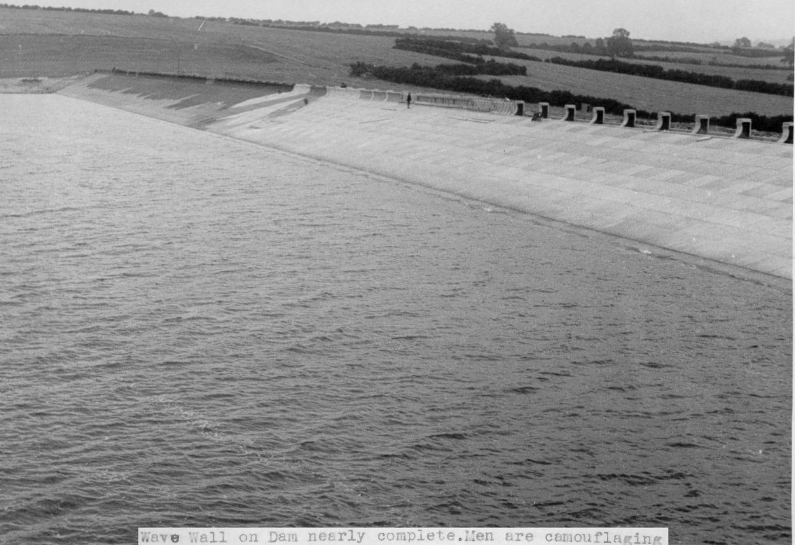
Wave Wall on Dam nearly complete. Men are camouflaging Dam with paint. 1940.