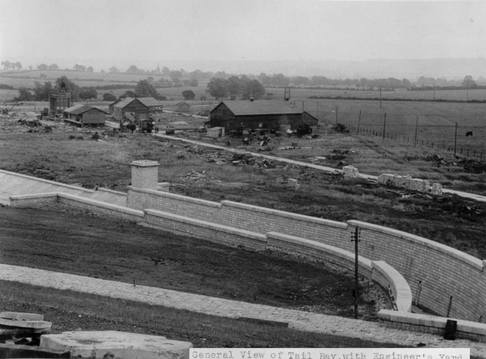
General View of Tail Bay, with Engineer's Yard. 1940.