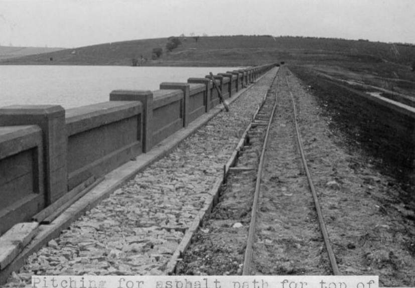
Pitching for asphalt path for top of Dam, 1940.