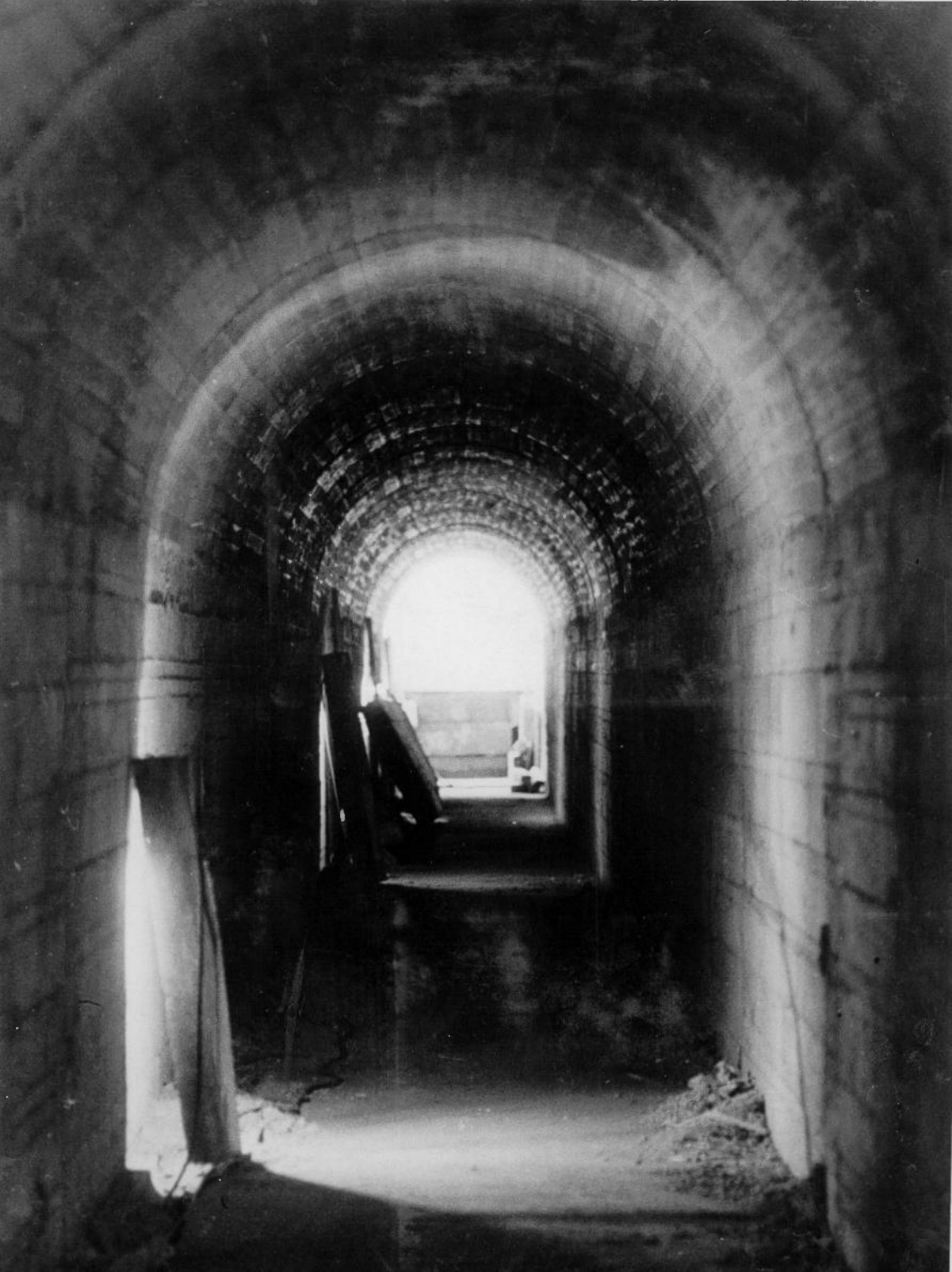
Tunnel underneath Stewarts & Lloyds sidings in Works. The 20" Pipe Line runs through. 1940.