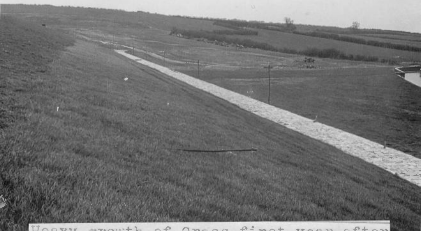
Heavy growth of Grass.first year after sowing,1939.On Bottom half of Dam,bad take on top half.March,1940.