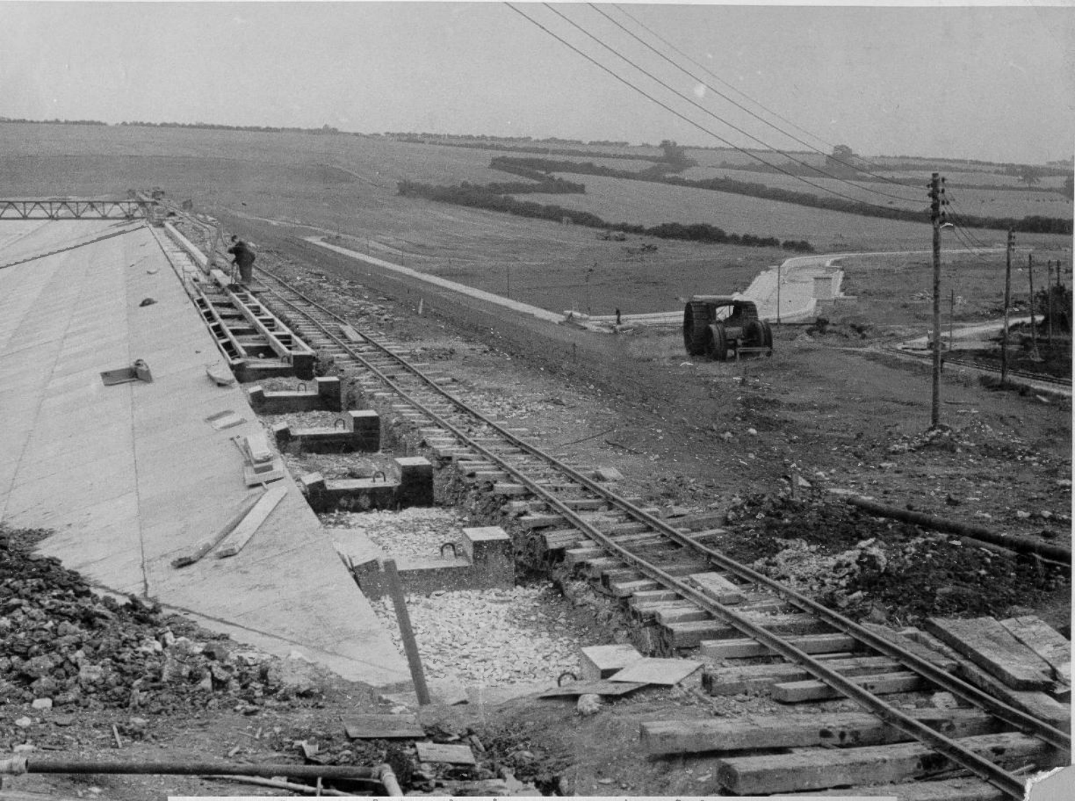
Dam nearly complete, showing concrete slabs on Upstream face & foundation of Wave Wall. 1940.