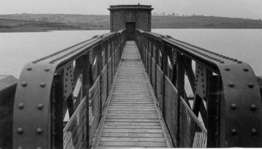
Bridge to Valve Tower.